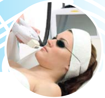
Photo Rejuvenation Therapy

One treatment for a combination of problems...